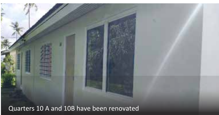
Quarters 10 A and 10B have been renovated