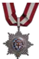
Companion of the Order of Fiji

For eminent achievement and merit of the highest degree for service to Fiji and humanity at large