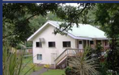
Engine Room renovated by PWD