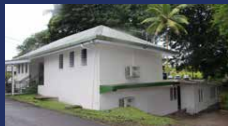
Ground Zero - Backgate Guard House